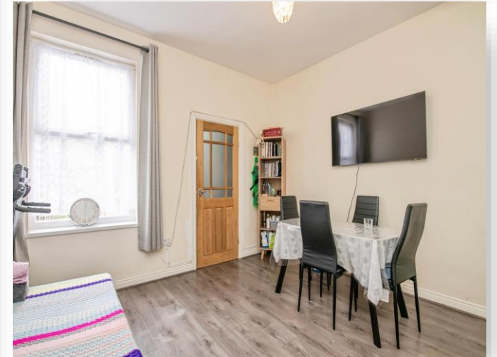
Ridgeway, Edgbaston BIRMINGHAM B17 8JB