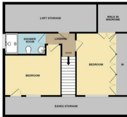
1ST FLOOR 719 sq.ft. (66.8 sq.m.) approx.