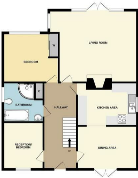
GROUND FLOOR 961 sq.ft. (89.3 sq.m.) approx.