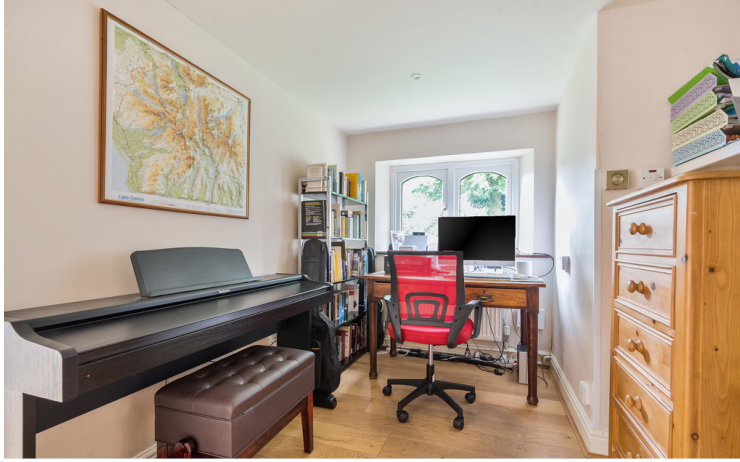
Ground Floor Snug