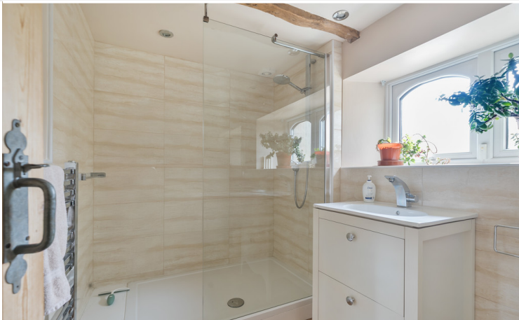
Downstairs Shower Room