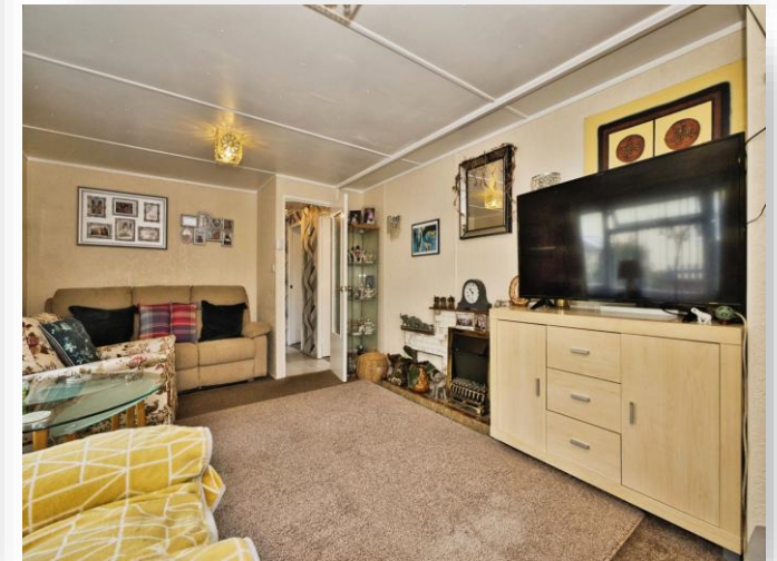
Primrose Hill, Charlton Mackrell, Somerton, TA11 7AP