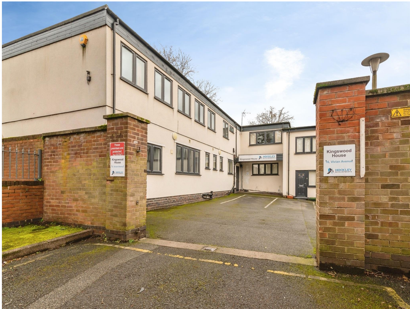
Kingswood House Vivian Avenue, Nottingham NG5 1AF