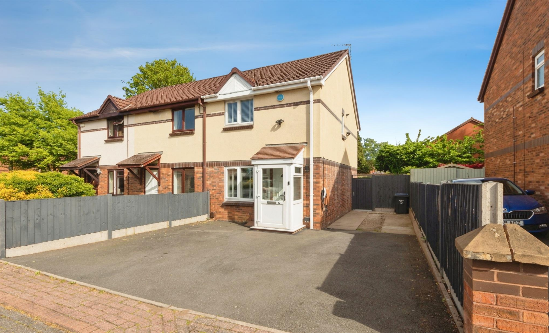
Rye Croft, BIRMINGHAM