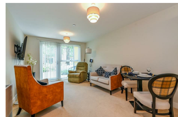
3 Nightingale Lodge | £250,000 Great Well Drive, Romsey, Hampshire, SO51 7AH