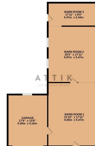
THE LANTERN BARN 1123 sq.ft. (104.3 sq.m.) approx.

TOTAL FLOOR AREA: 1123 sq.ft. (104.3 sq.m.) approx. While every attempt has been made to ensure the accuracy of the figures contained here, measurements of floors, walls, rooms etc. are given for an approximate and are not intended to be used for any purpose other than that of a guide only. The services, systems and appliances shown have not been tested and no guarantee is given as to their operation or efficiency at the time of the photos. Made with SketchUp 2022