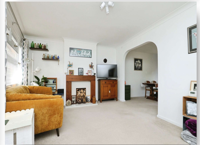
Meredith Road, Norwich NR6 6PD