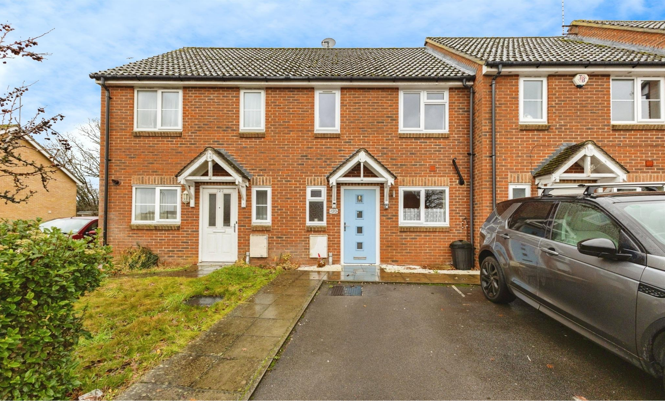
Jersey Drive, Winnersh Wokingham RG41 5FR