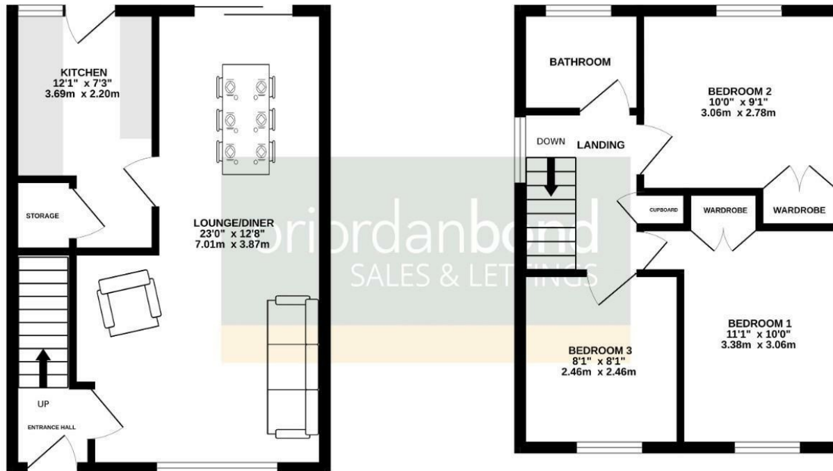
1ST FLOOR 354 sq.ft. (32.9 sq.m.) approx.

TOTAL FLOOR AREA: 716 sq.ft. (66.5 sq.m.) approx.