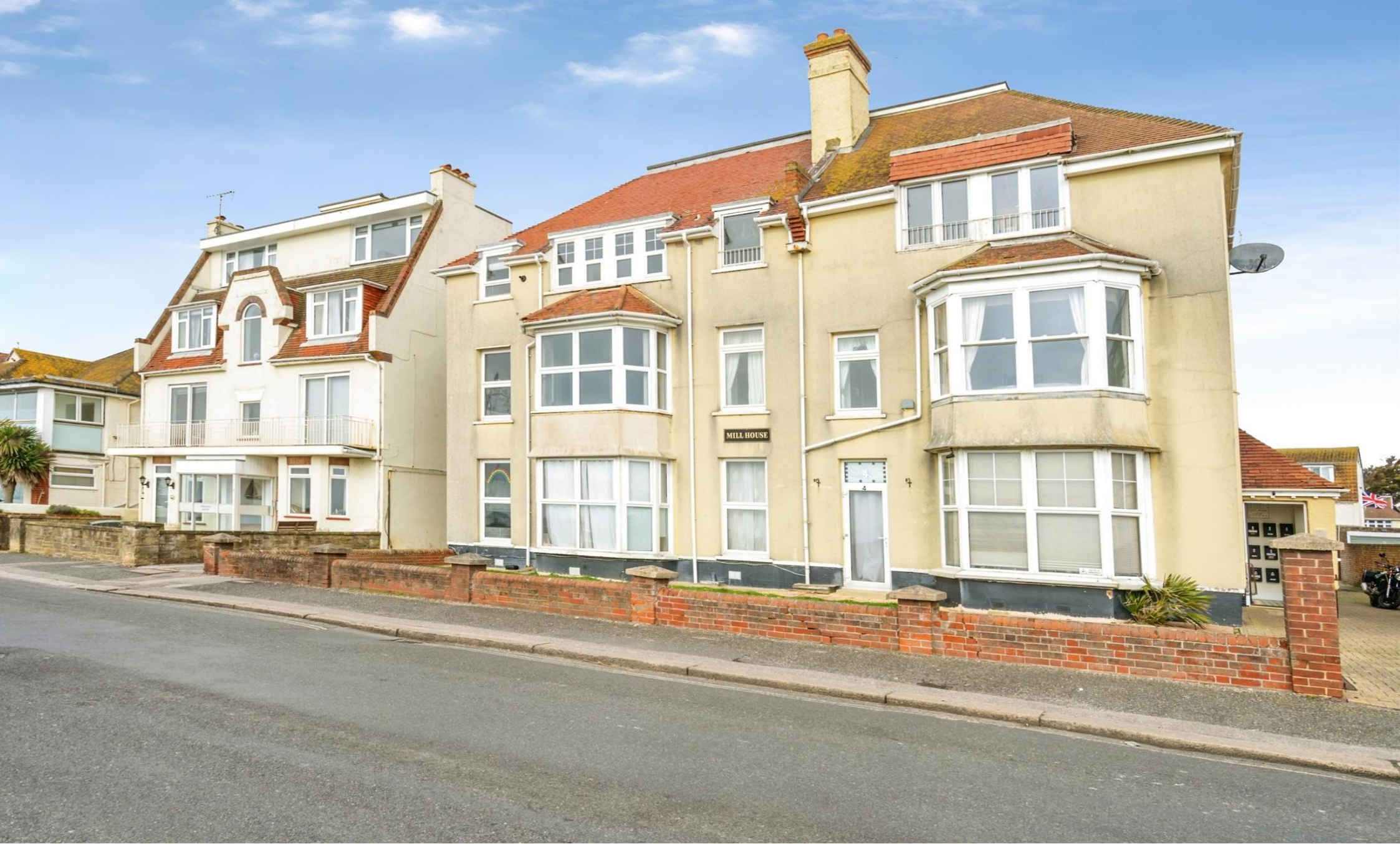
Mill House Marine Drive West, Bognor Regis PO21 2QA