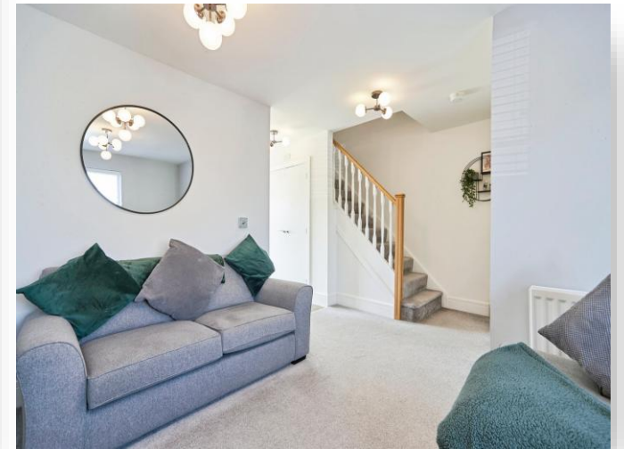
Sandhill Fold, Idle Bradford BD10 8XB