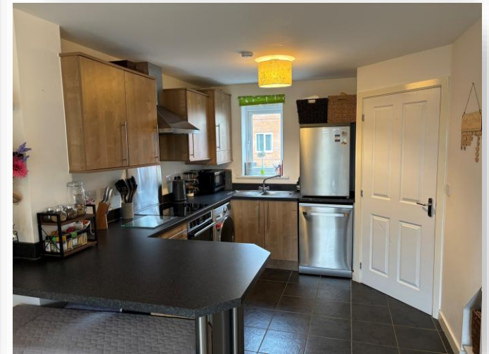
Bedstone Way, Farcet Peterborough PE7 3DW