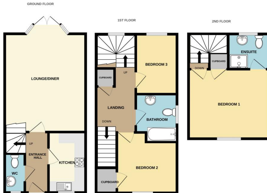
10 ELDER CLOSE, WITHAM ST HUGHS, LN6 9NS

Whilst every attempt has been made to ensure the accuracy of the floorplan contained here, measurements of doors, windows, rooms and any other items are approximate and no responsibility is taken for any error, omission or mis-statement. This plan is for illustrative purposes only and should be used as such by any prospective purchaser. The services, systems and appliances shown have not been tested and no guarantee as to their operability or efficiency can be given. Made with Metropix ©2025