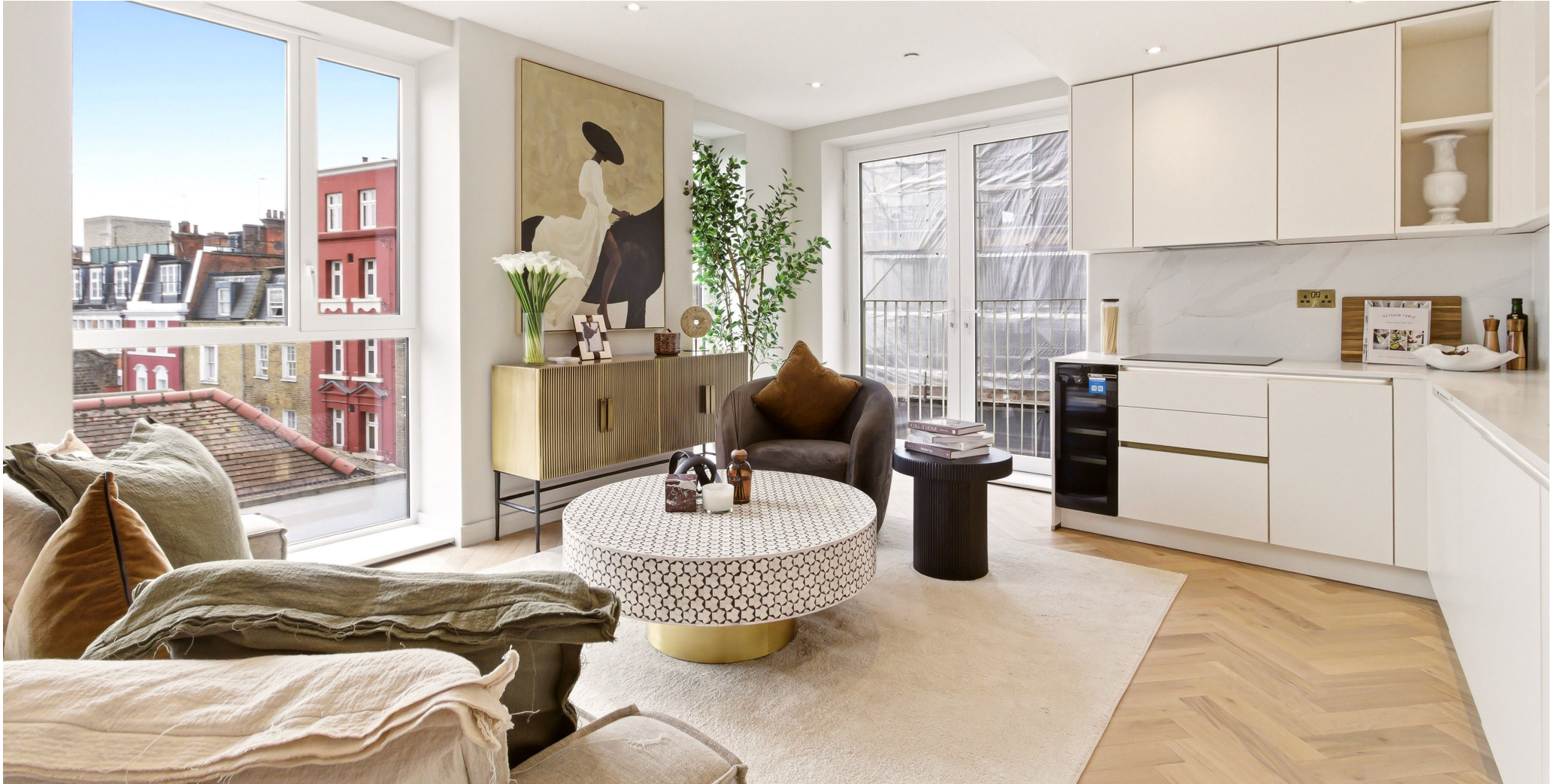
OLD PYE STREET, Westminster SW1P