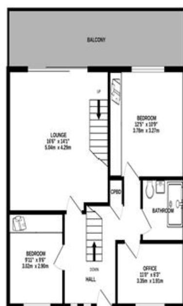
GROUND FLOOR 676 sq.ft. (62.8 sq.m.) approx.