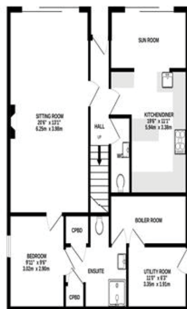
LOWER GROUND FLOOR 834 sq.ft. (77.5 sq.m.) approx.