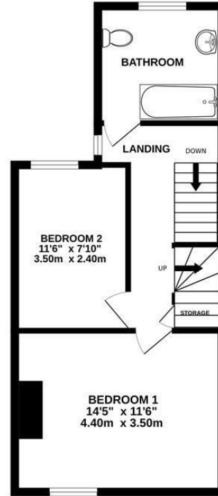
1ST FLOOR 411 sq.ft. (38.2 sq.m.) approx.