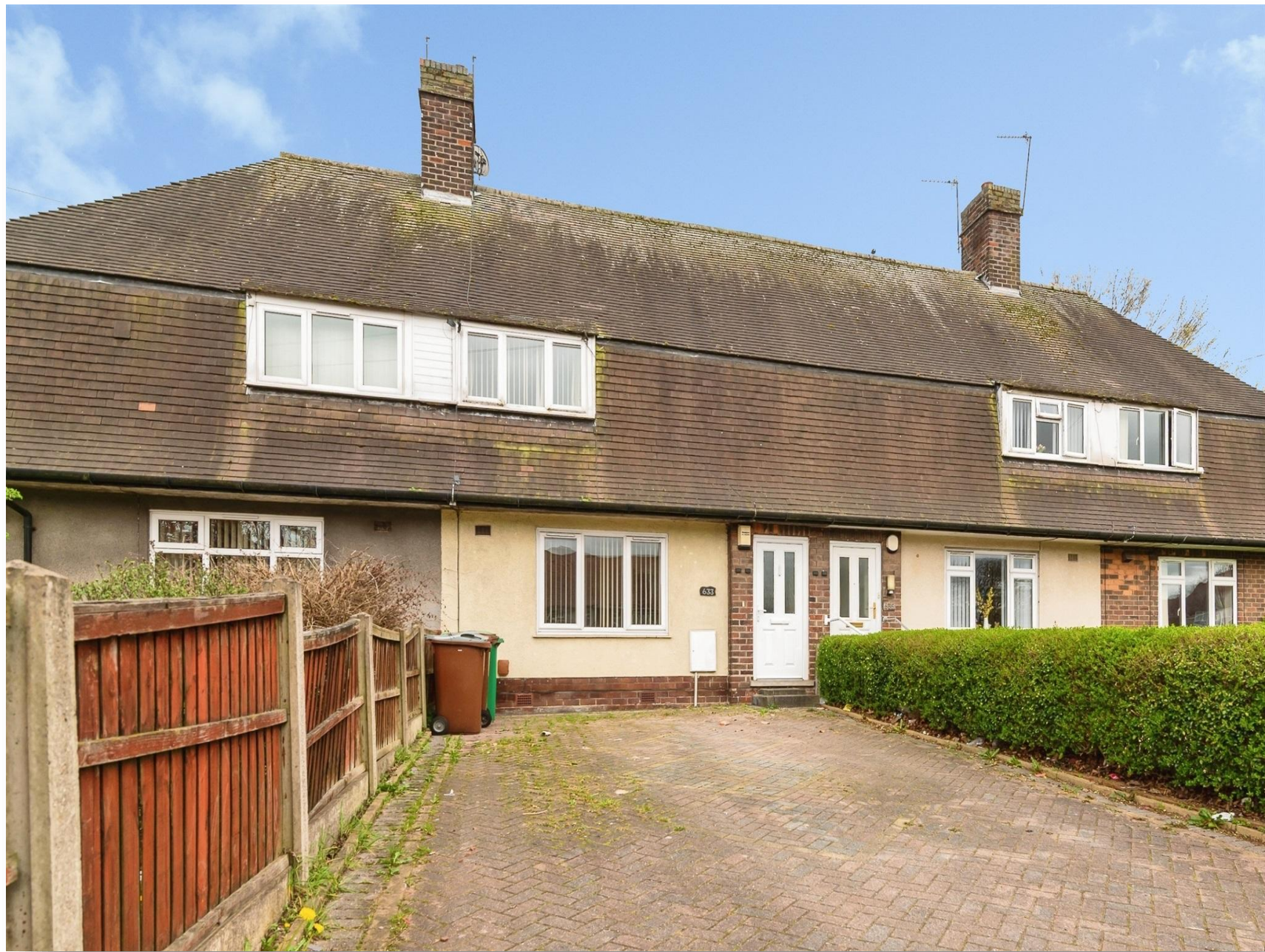
Aspley Lane, Nottingham NG8 5RY