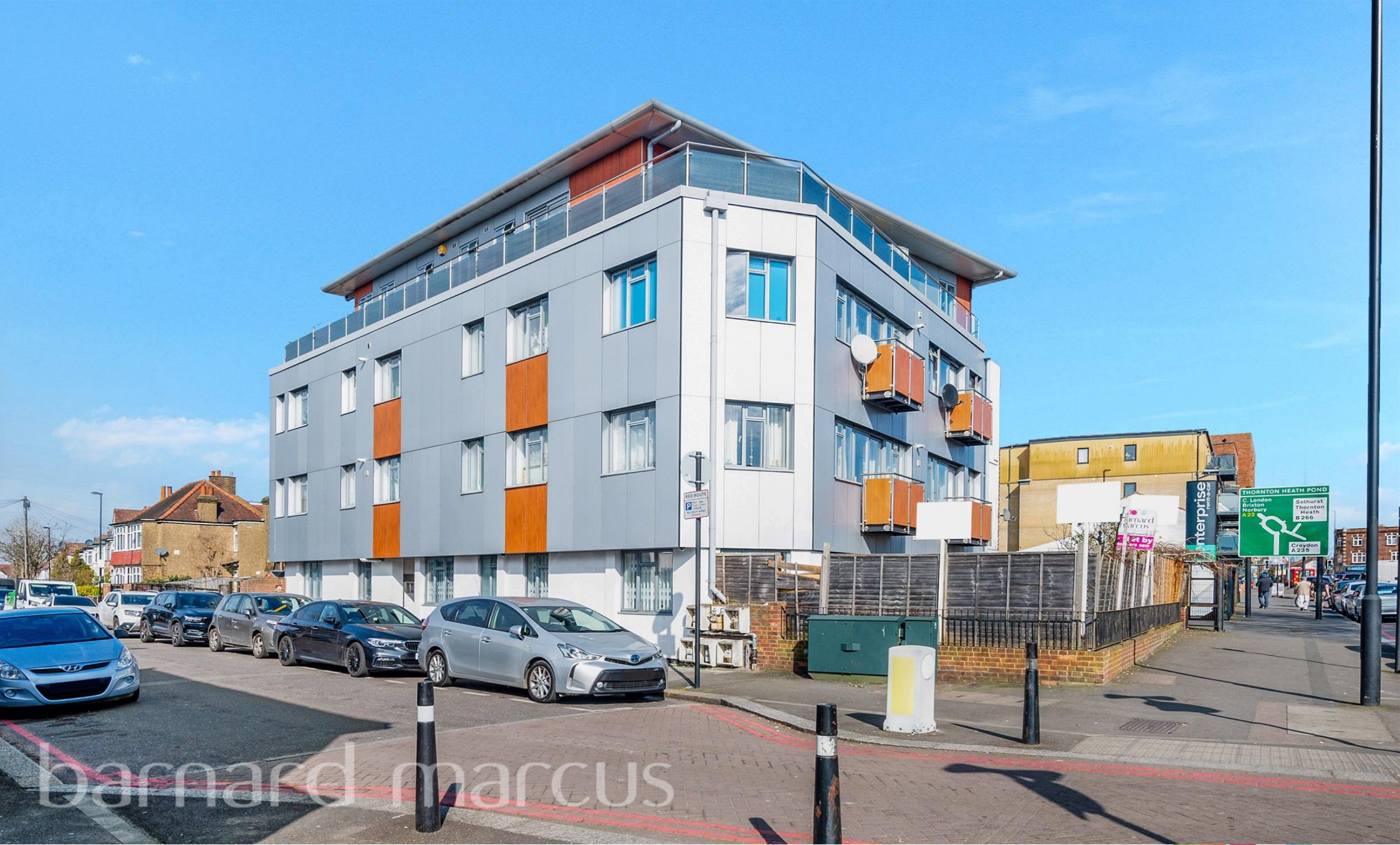
Redwood House Thornton Road, Thornton Heath, CR7 6BA