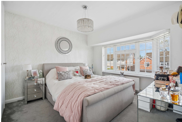
BEDROOM ONE bay window, radiator, slatted blinds, fitted wardrobes,