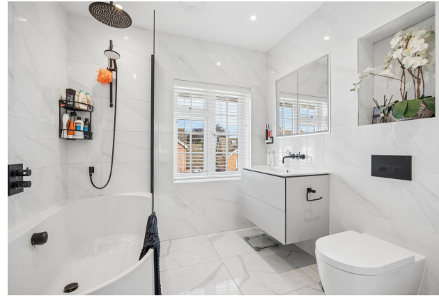
BATHROOM refitted with a white suite of large panel bath with overhead rose, shower attachment, screen, tiled walls and floor, heated towel rail, wash basin with vanity drawers, WC.