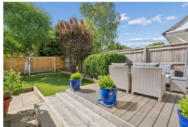
THE REAR GARDEN has an attractive raised deck with steps down to a stone patio and to an area of artificial grass with railway sleepers to its edges, maturing shrubs and trees and panel fencing to rear.

THE FRONT GARDEN includes a lawn area with stone steps up to the front door and a block paved driveway for the parking of three cars with outside tap and access to the family room.