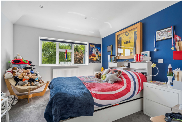
BEDROOM TWO , mirror wardrobe, radiator.