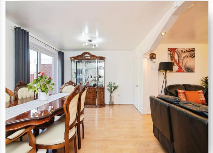
Stableford Close, BIRMINGHAM B32 3XL