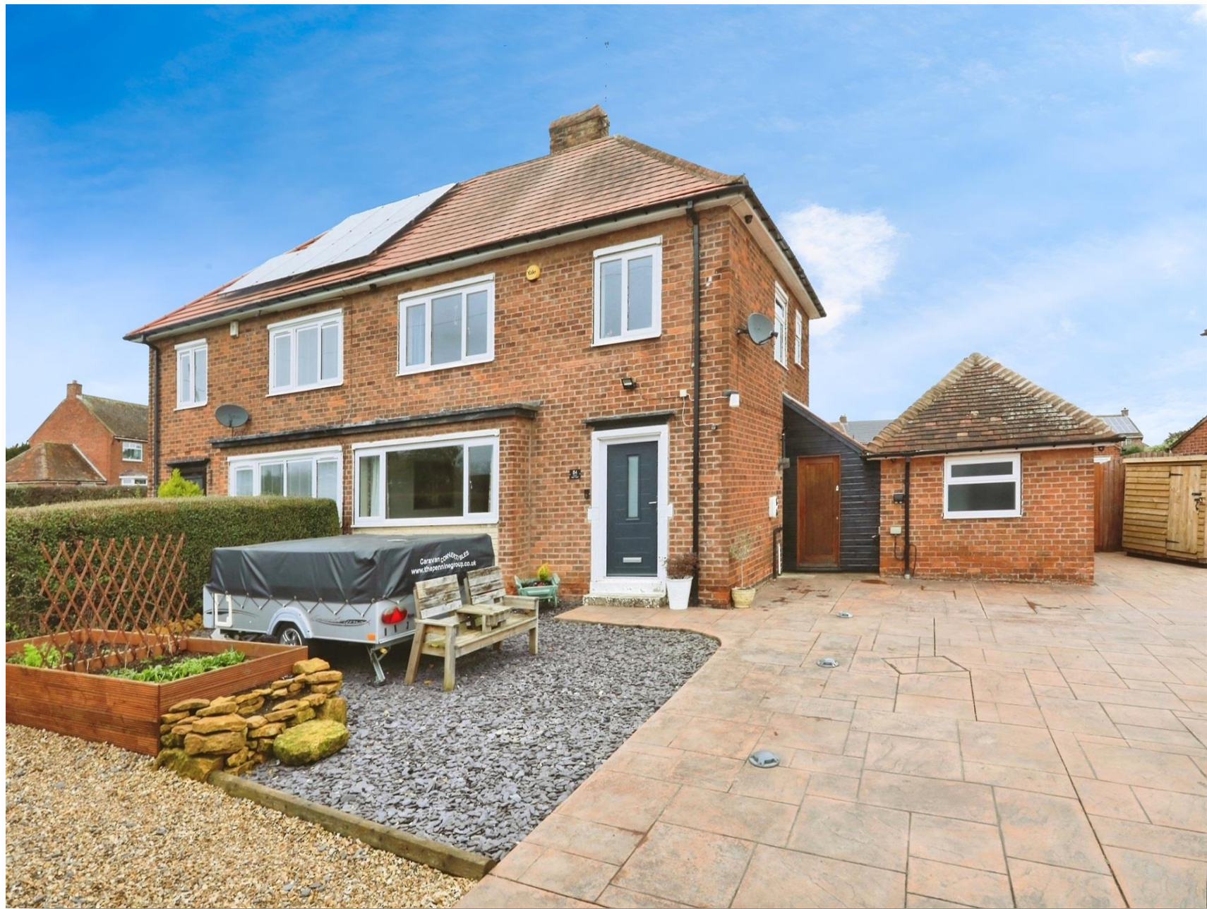
Long Lane, Carlton-In-Lindrick Worksop S81 9AR