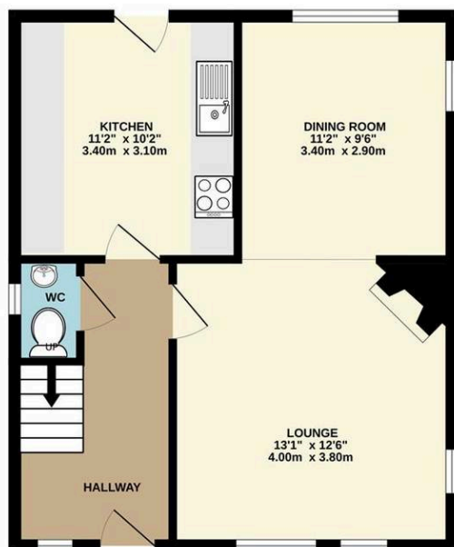
GROUND FLOOR 479 sq.ft. (44.5 sq.m.) approx.