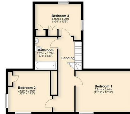
Total area: approx. 200.8 sq. metres (2161.1 sq. feet)