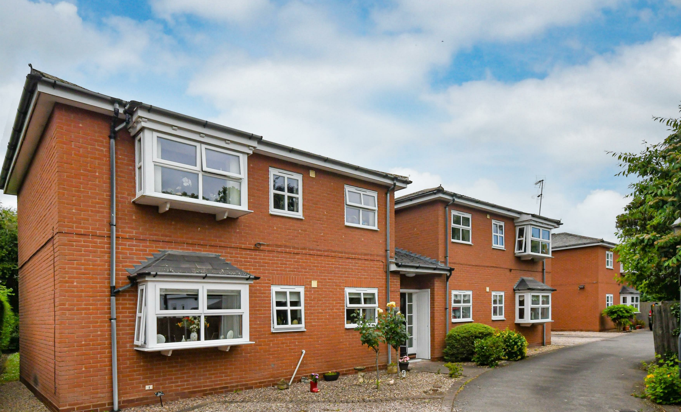
Flat 3, Maypole Court Gravel Hill, Wombourne, Wolverhampton, WV5 9HA