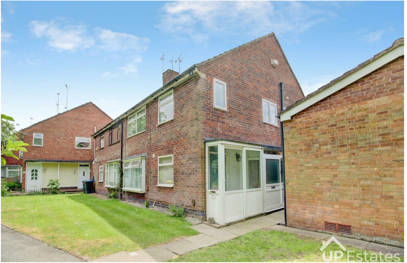
Linnet Close, Coventry