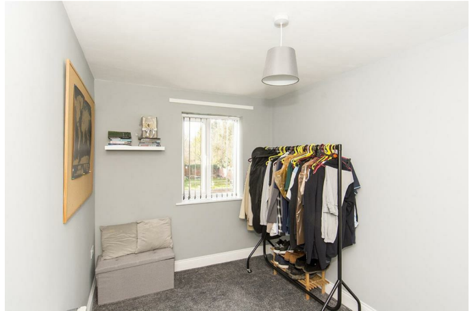
11' 6" x 7' 6" (3.51m x 2.29m) UPVC double glazed window. Electric heater.