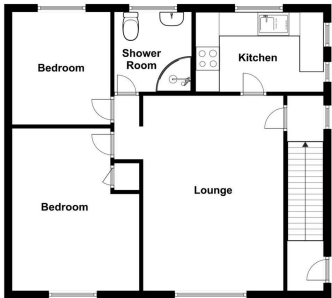
© Essex EPCs This floor plan is not to scale and is for illustrative purposes only. We make no guarantee, warranty or representation as to its accuracy and completeness.