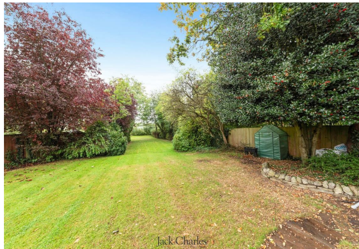
Jack Charles Estate Agents