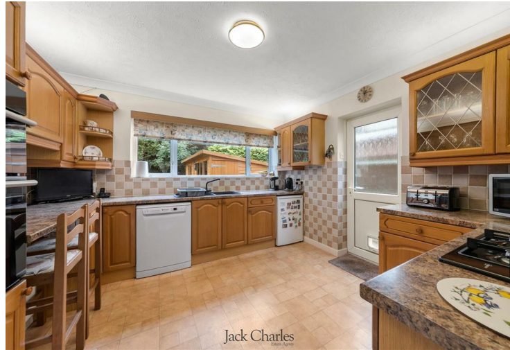
Jack Charles Estate Agents