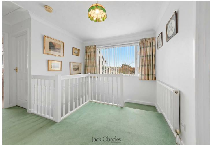
Jack Charles Estate Agents