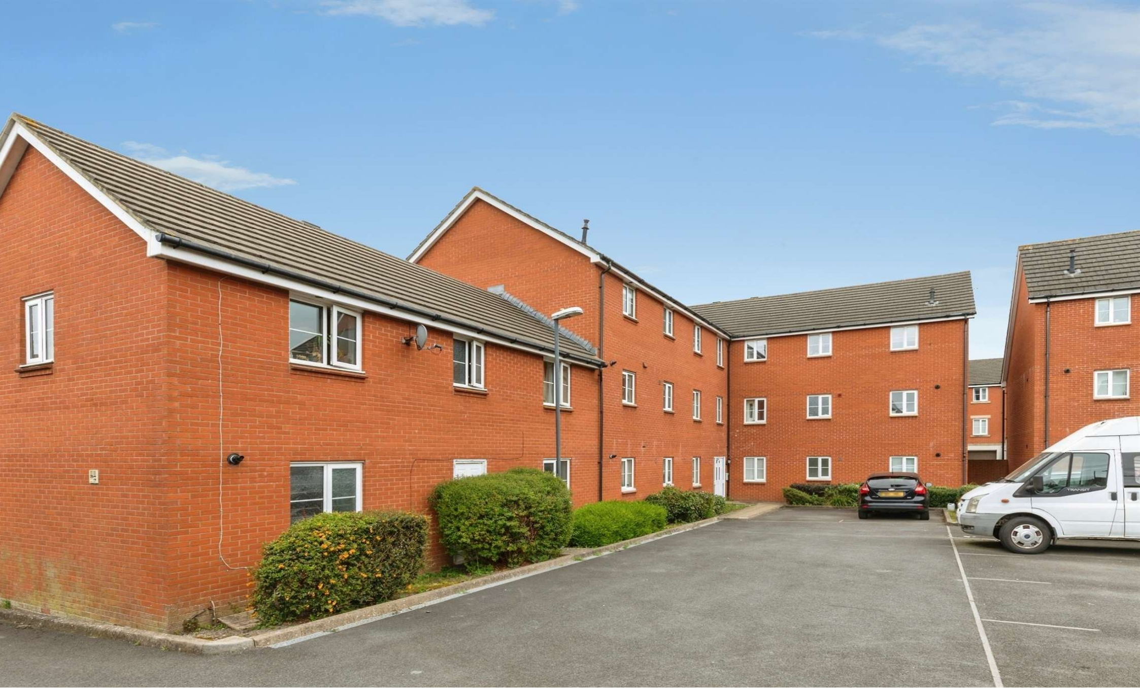
Wordsworth Road, Bristol BS7 0ET