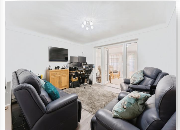
Howbeck Close, Prenton, CH43 6TH