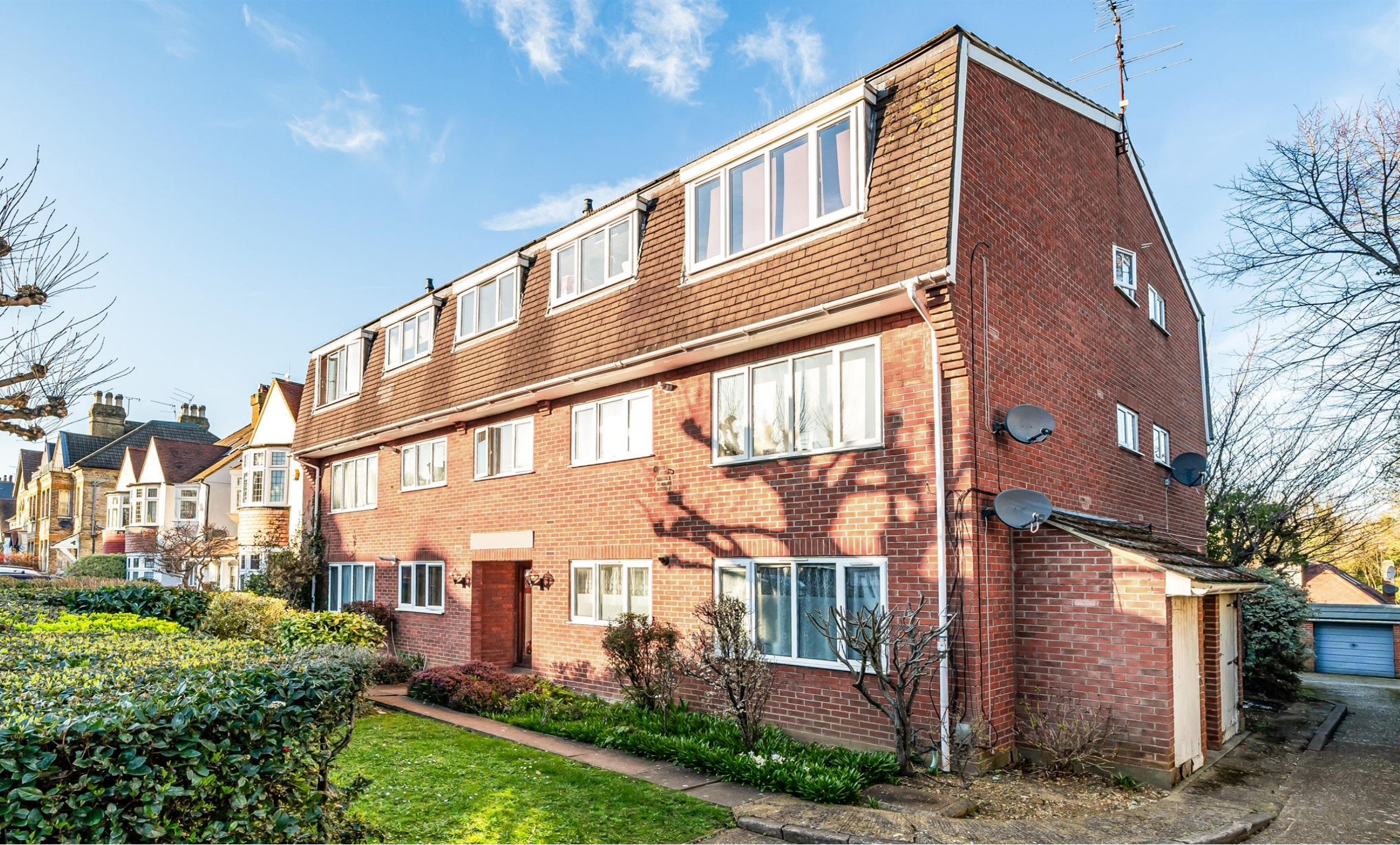
Trevera Court, Chase Green Avenue, Enfield, EN2 8DS