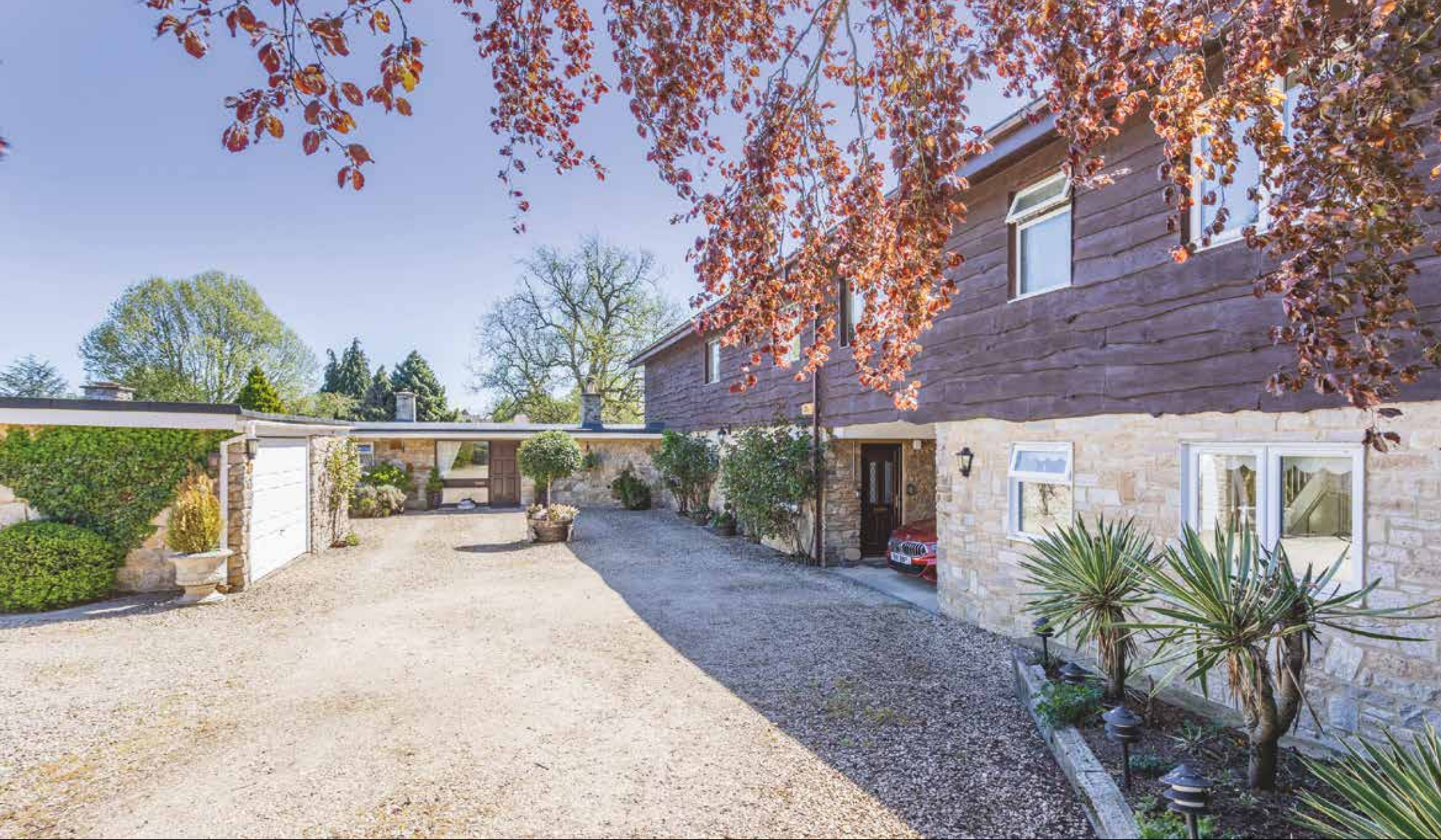
Heatherstone Lodge Banbury Road | Finmere | Buckinghamshire | MK18 4AJ