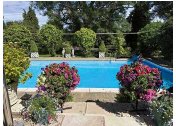
Photos taken throughout the seasons by the current custodians of the house