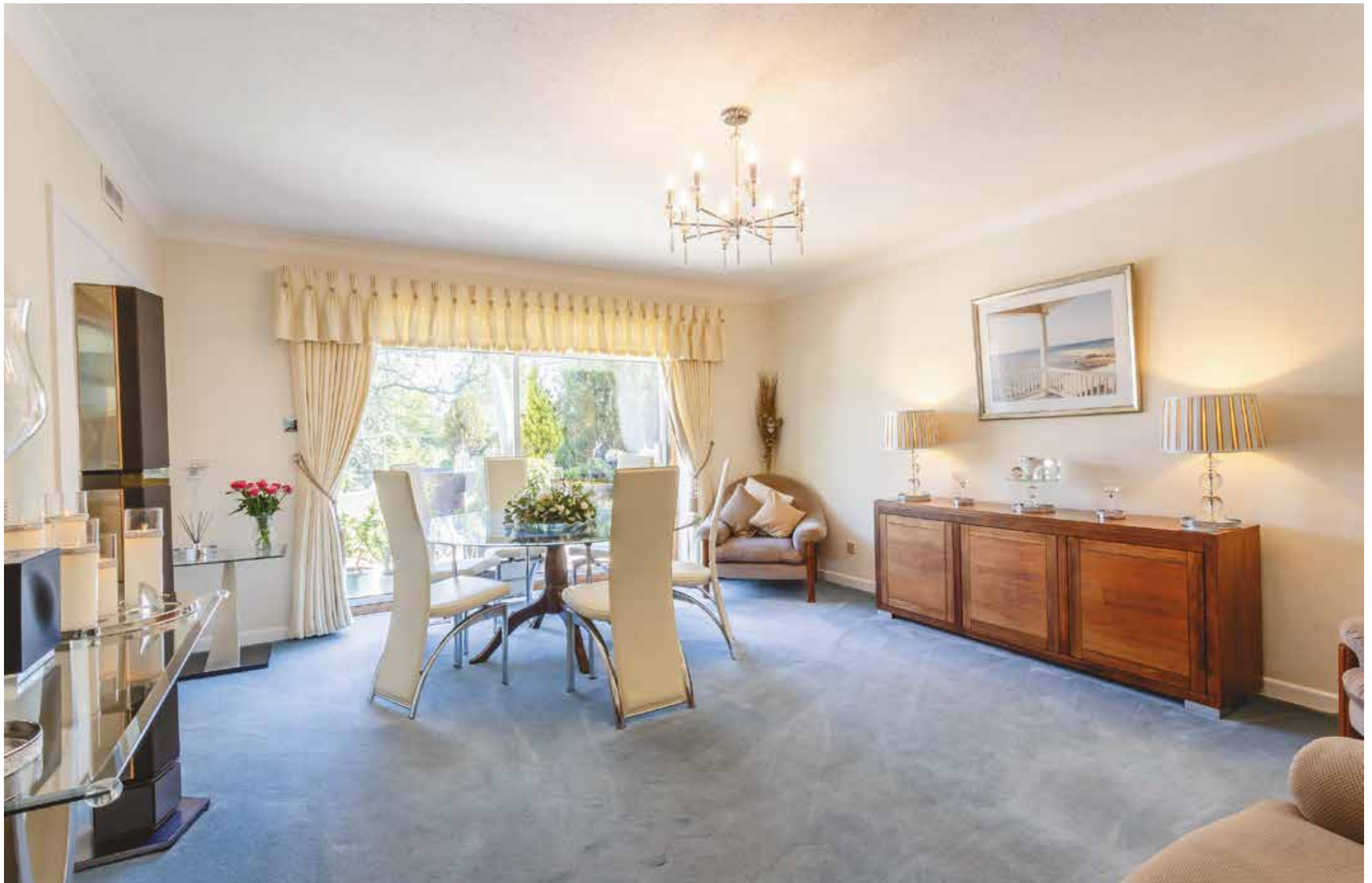
The dining room is perfect for entertaining with ample room for a large table and a dozen chairs, there are also French doors to the garden and terrace. The office is quietly tucked away with a rear window.