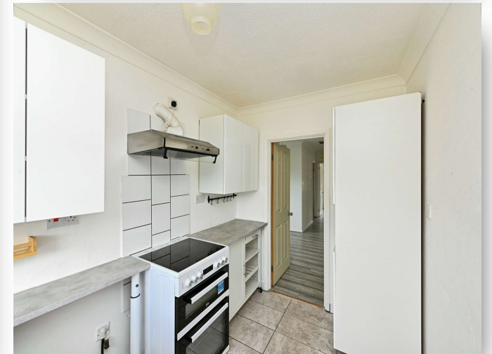
Hickling, King's Lynn, PE30 4XH