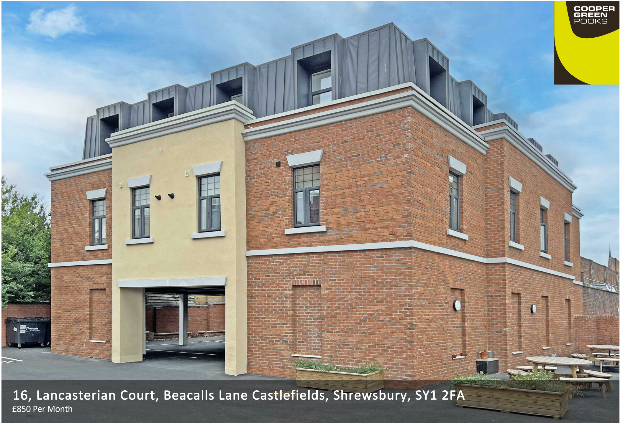
16, Lancasterian Court, Beacalls Lane Castlefields, Shrewsbury, SY1 2FA £850 Per Month