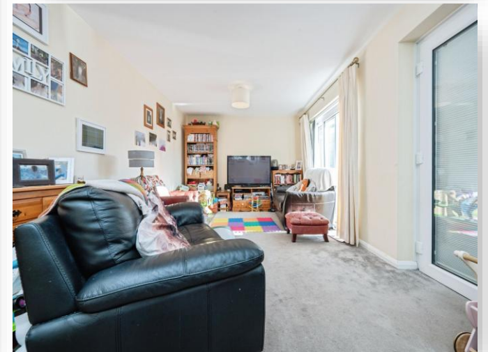
Camberton Road, Linslade, Leighton Buzzard, LU7 2UW