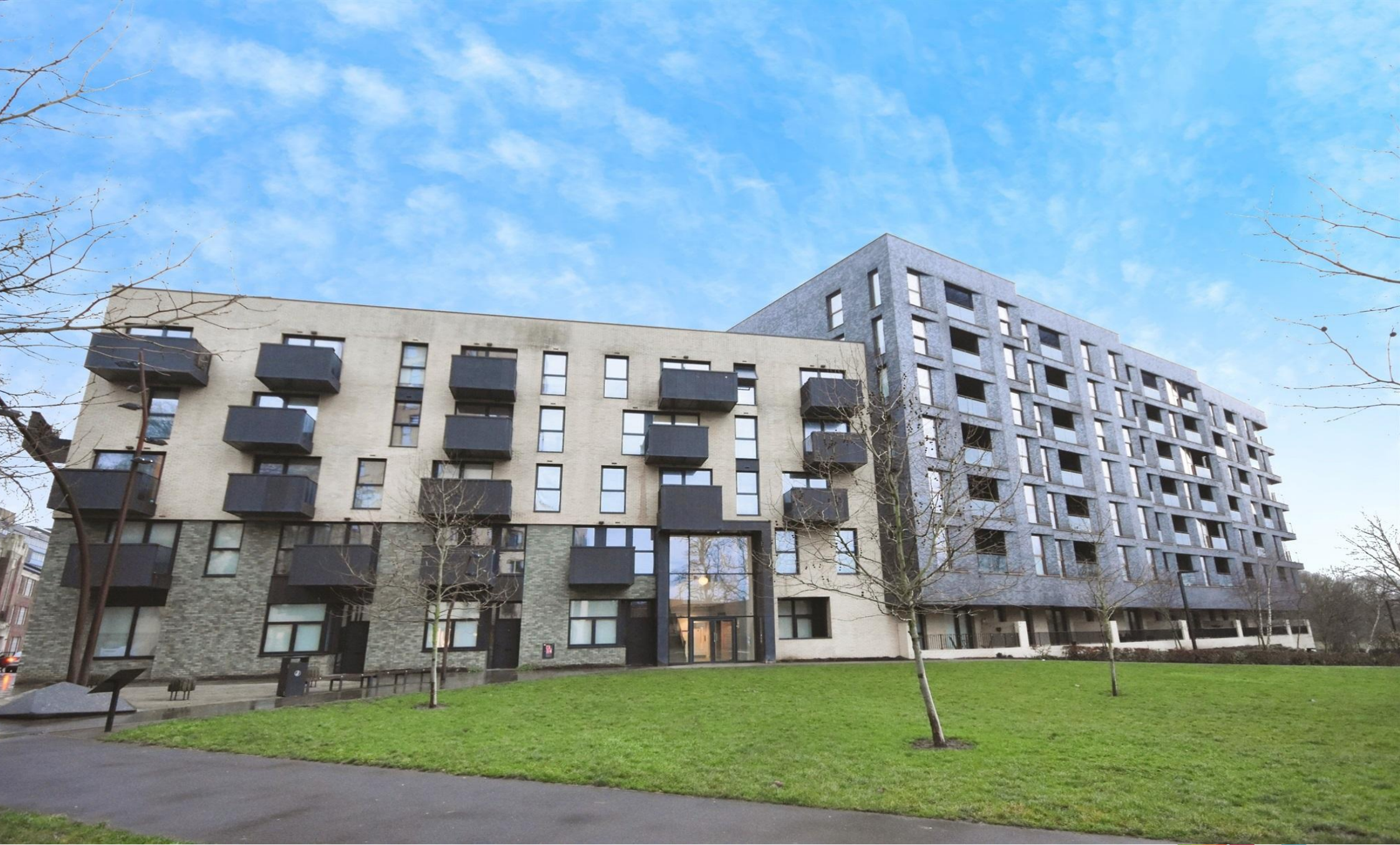
Newcombe Court Burgess Springs, CHELMSFORD CM1 1QN