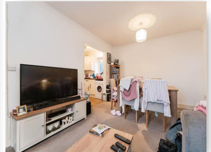
The Moorings, Lynn Road, Littleport Ely CB6 1FU