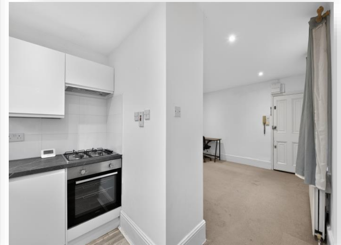
Earlsfield Road, London SW18 3DB