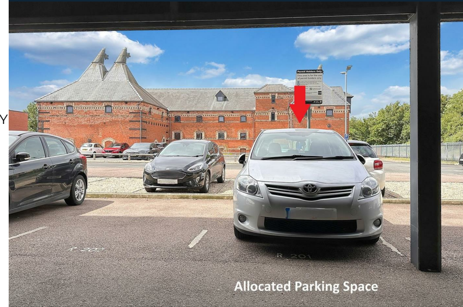
Allocated Parking Space