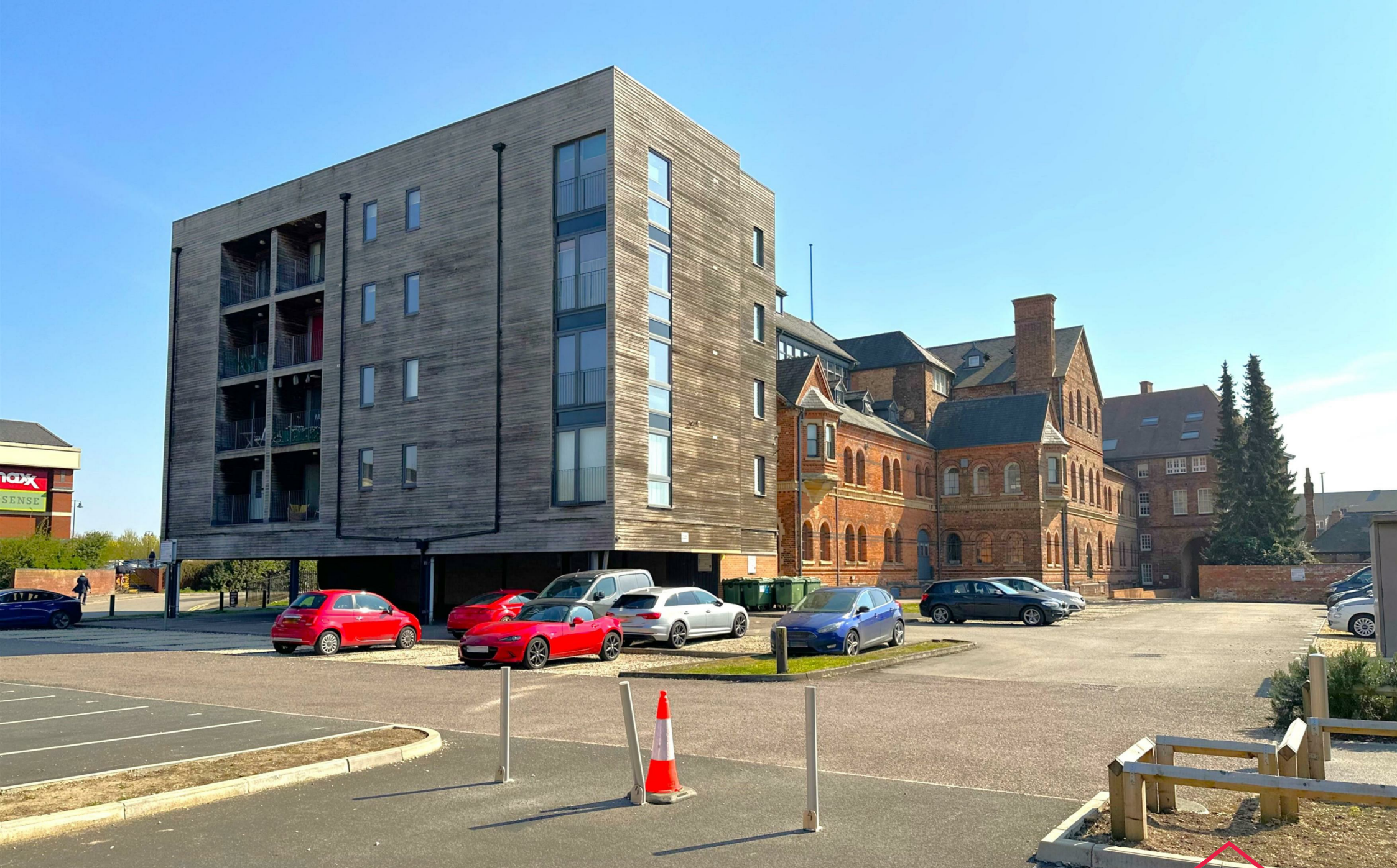
The Roundhead Building, Warwick Brewery