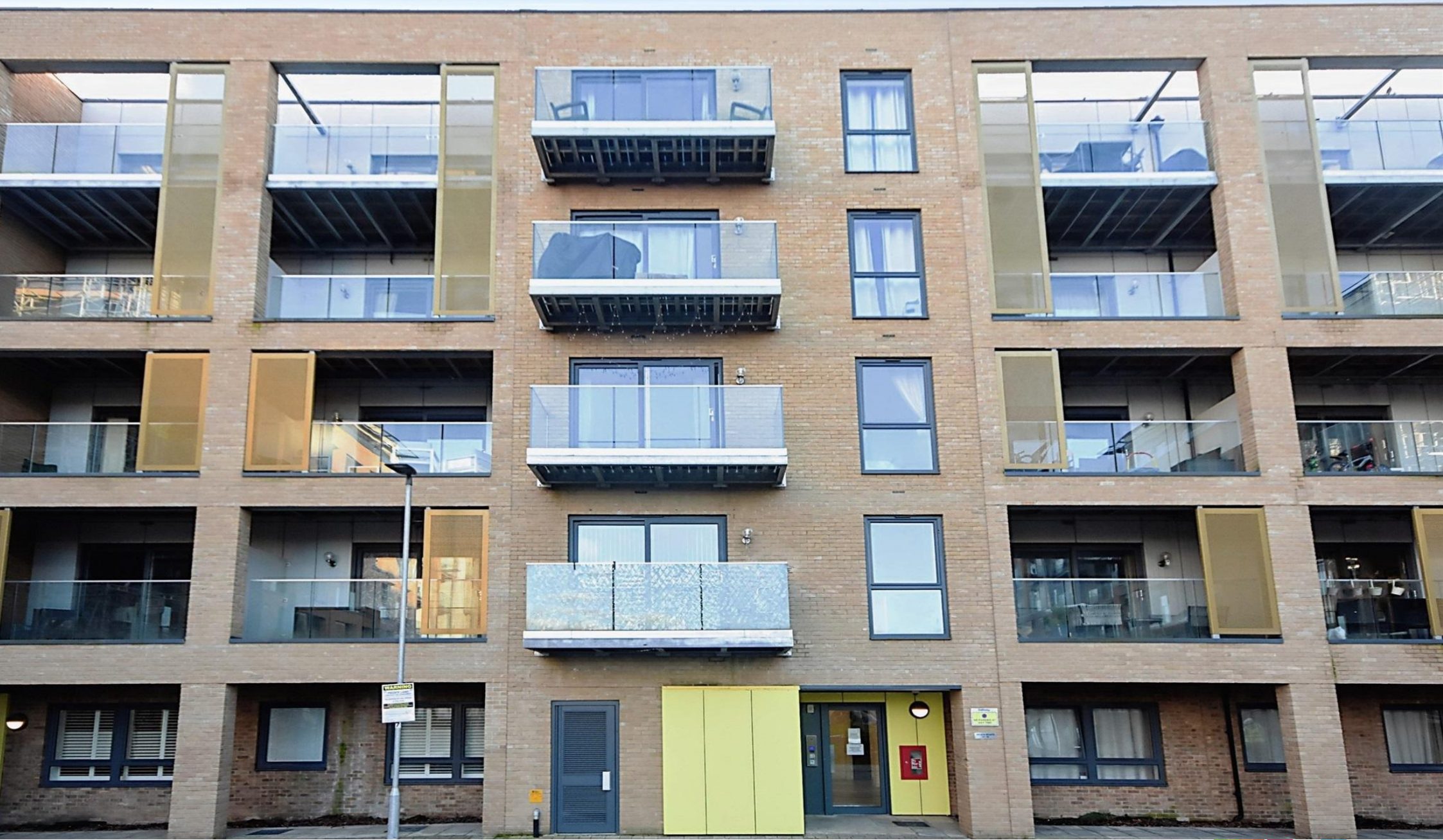
Watson Heights, Chelmsford CM1 1AG