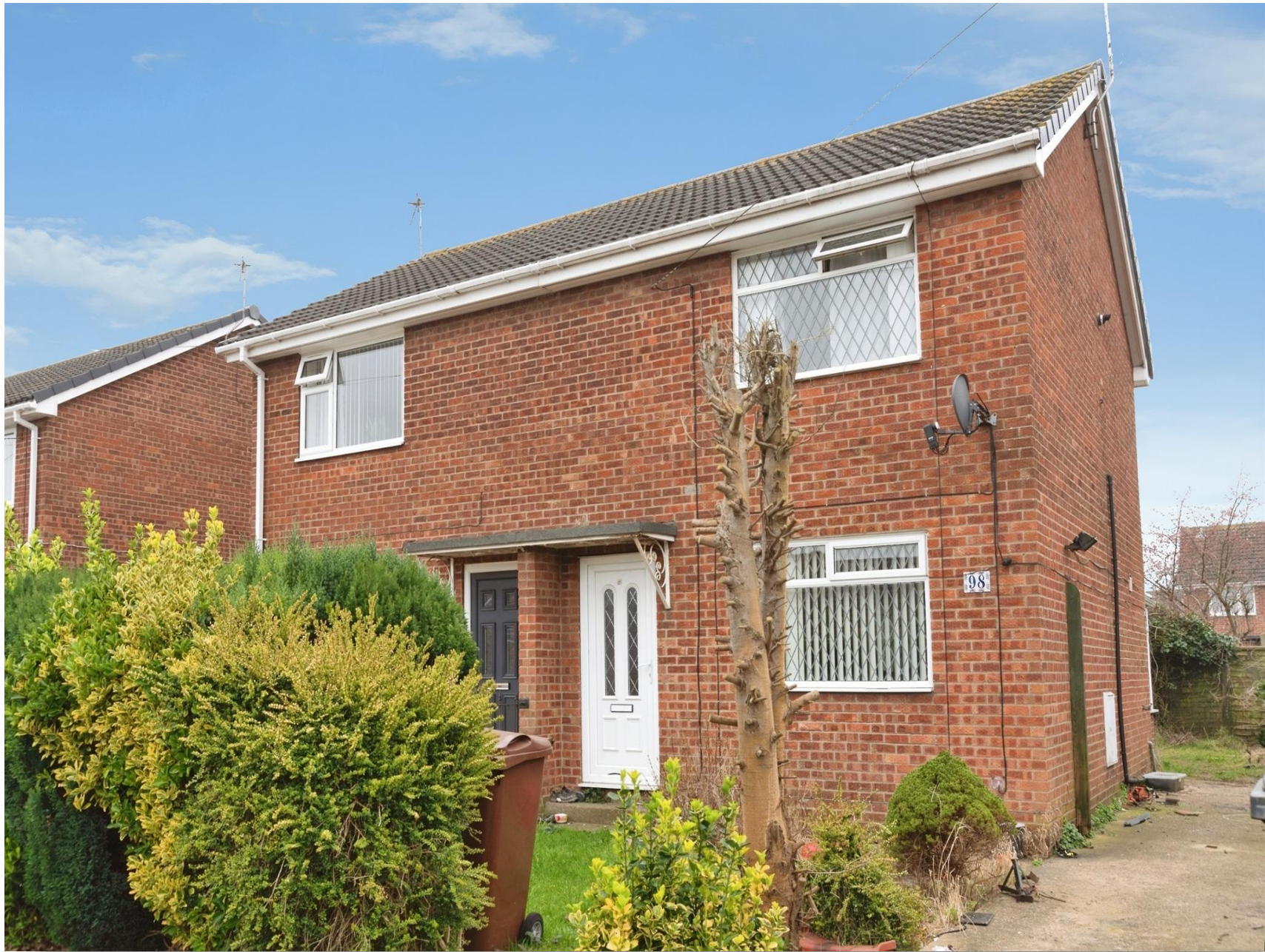
Willowdale, Hull, HU7 6DW