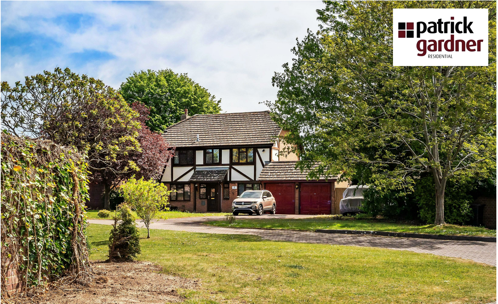
6 Aston Close, Ashted, Surrey, KT21 2LQ