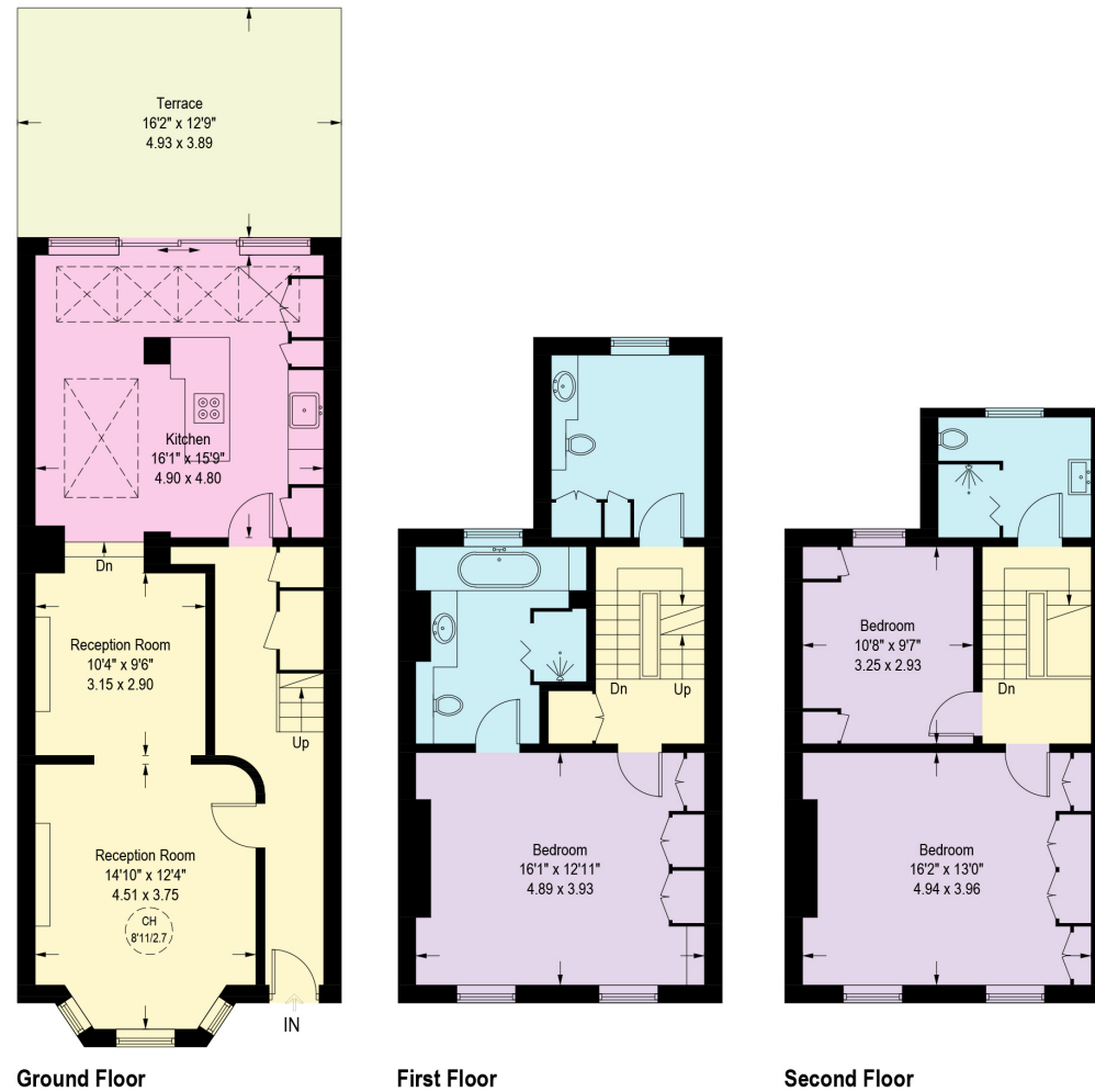
Illustration for identification purposes only, measurements are approximate, not to scale. (ID828442)

Approximate Gross Internal Area = 150.1 sq m / 1,616 sq ft