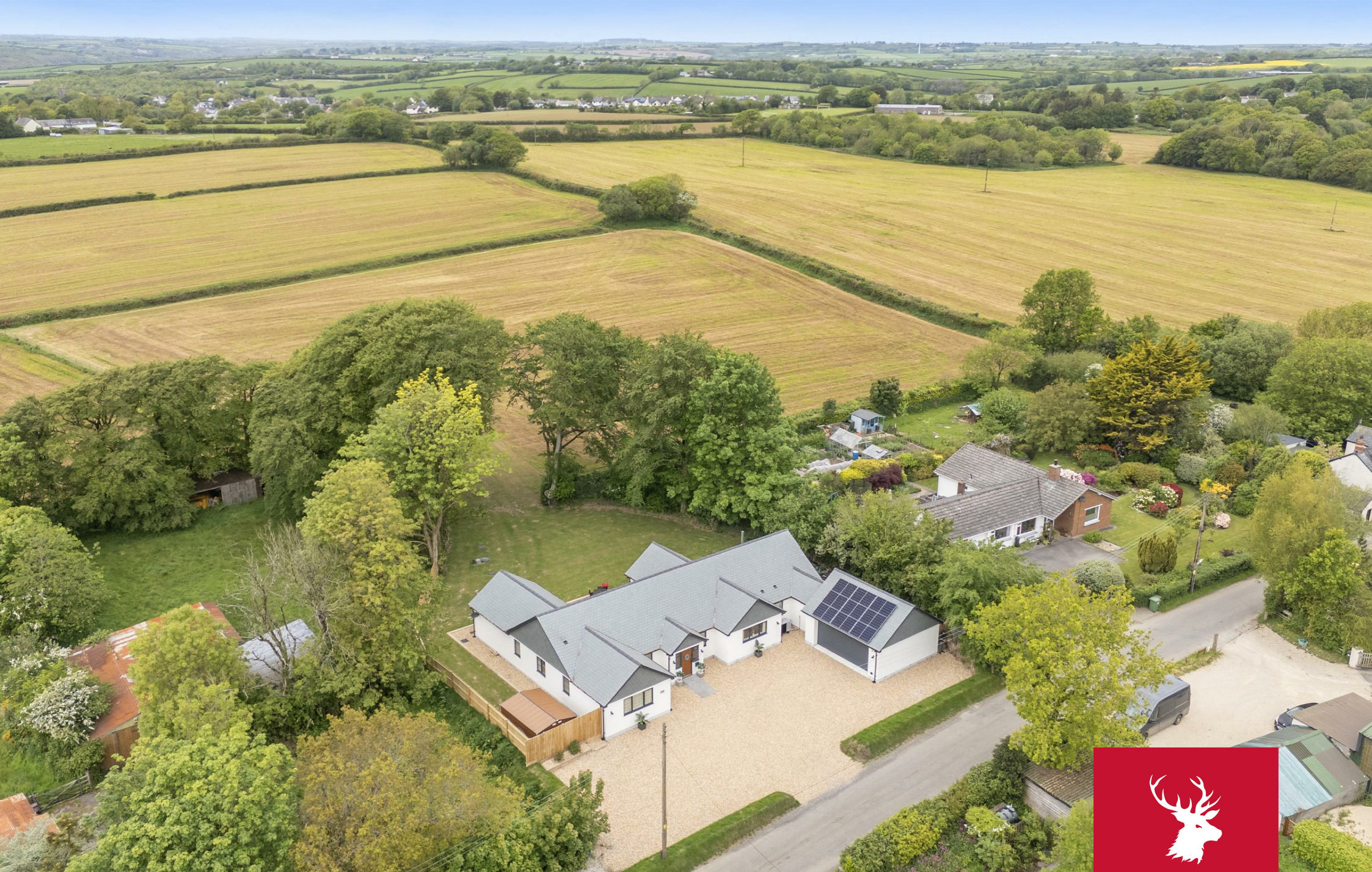
Honey Bee Cottage