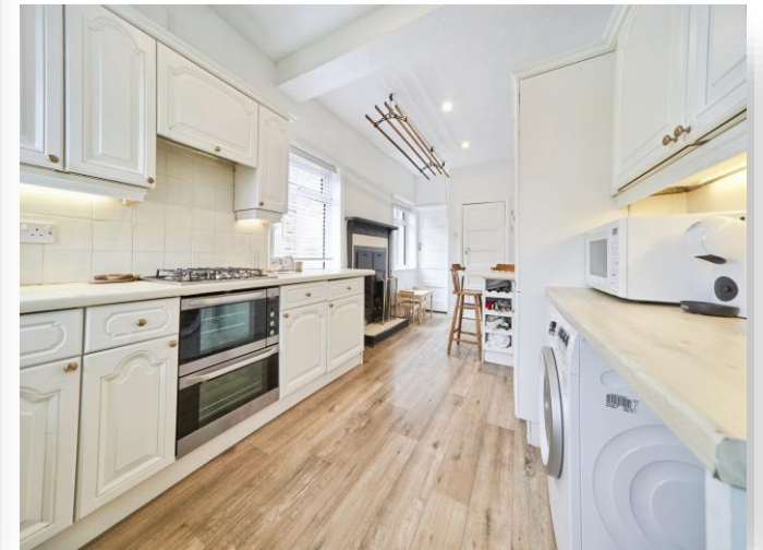
Haworth Road, Bradford BD9 6LH