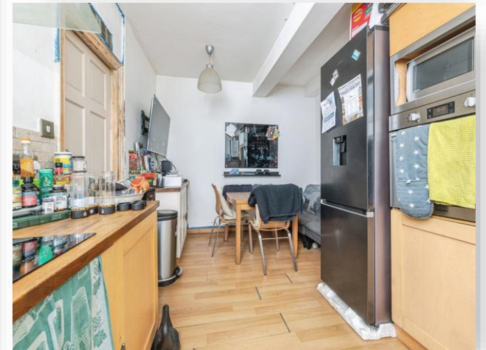
Woodhead Road, Holmbridge Holmfirth HD9 2NW