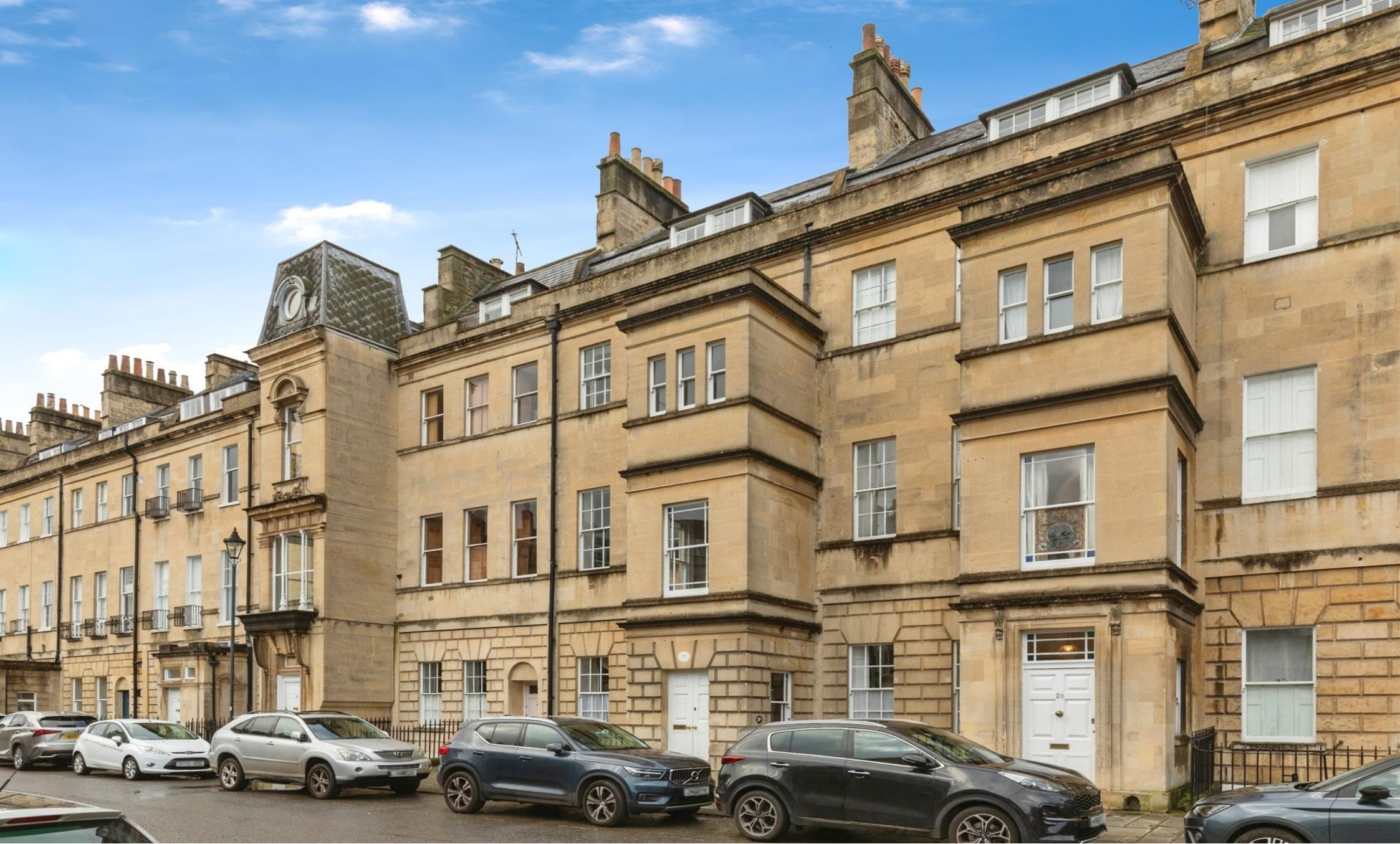
Flat 3 Marlborough Buildings, Bath BA1 2LY