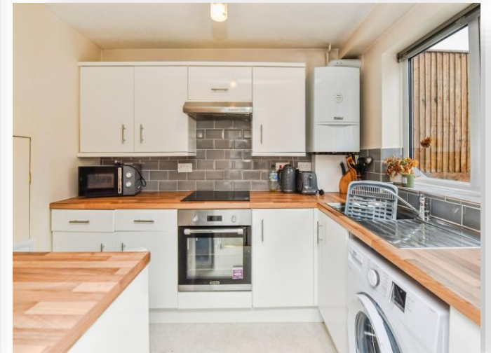
Penny Farthing Row, Westbury BA13 3TP